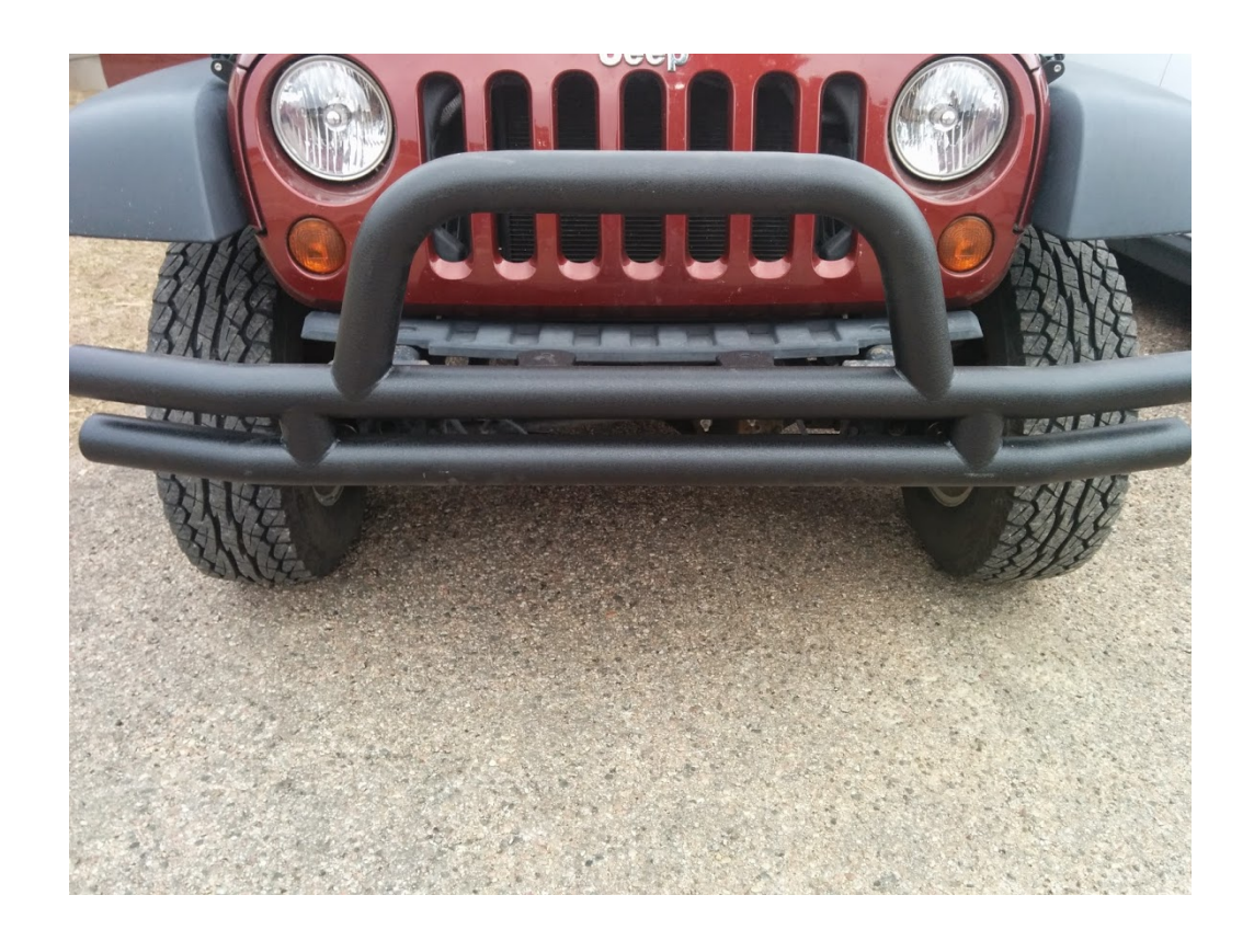
Installation Instructions Written by ExtremeTerrain Customer Cory Beebe 12/07/2014