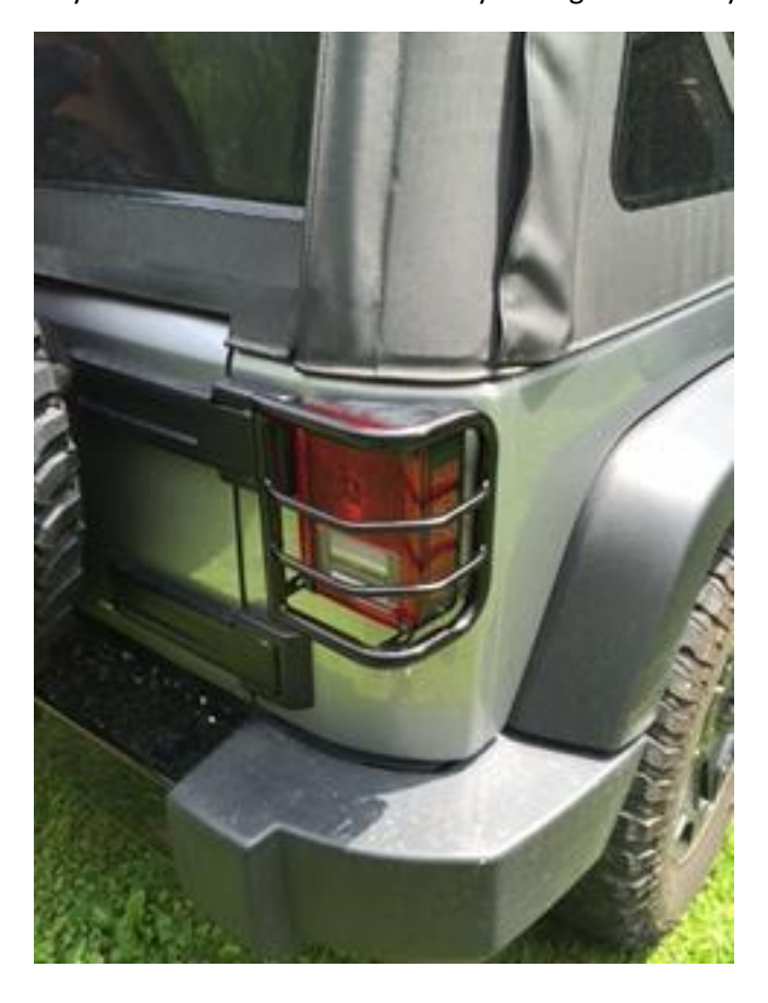
Installation Instructions Written by ExtremeTerrain Customer Rick Cater 06/05/2015

4. Finally, tighten all screws as you check for clearance on body and light assembly.