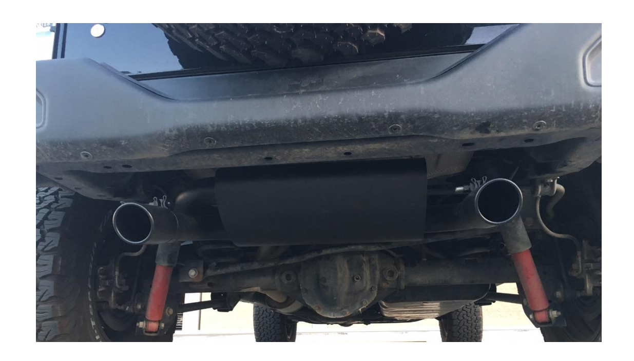
Installation Instructions Written by ExtremeTerrain Customer Terry Hunt 07/12/2017