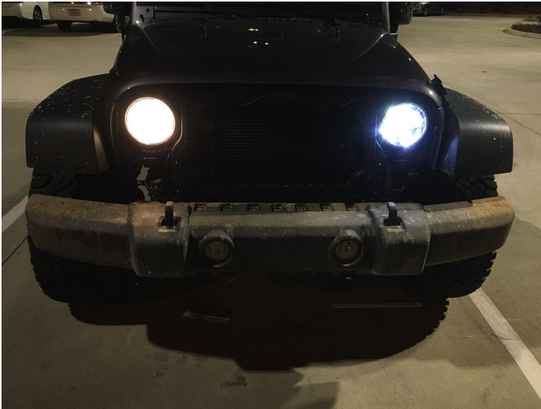
13. AFTER shot with the Lifetime LED bulbs installed.