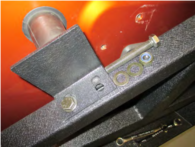
STEP 11 // Install the carrier bump stops.