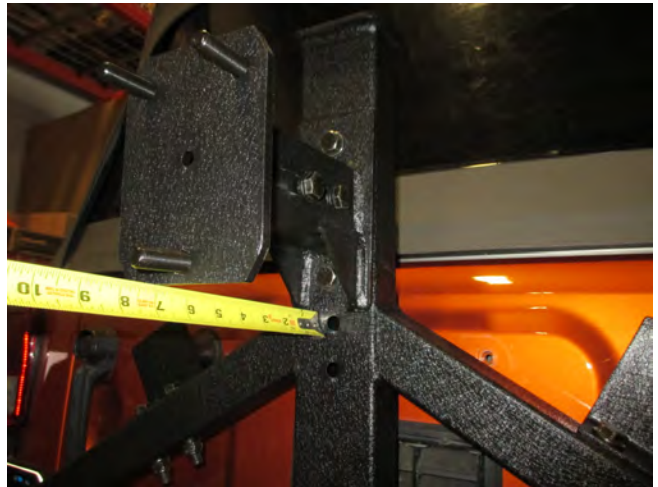
STEP 14 // Subtract a half inch from the previous measurement, and set the carrier to the new measurement. This insures the tire is against the carrier.