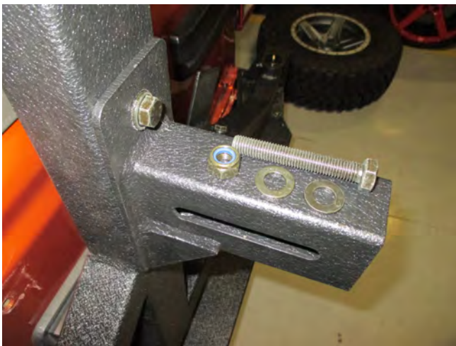
STEP 12 // Install the rear tire carrier and secure it to the rear swing arm at the desired height using the supplied hardware.