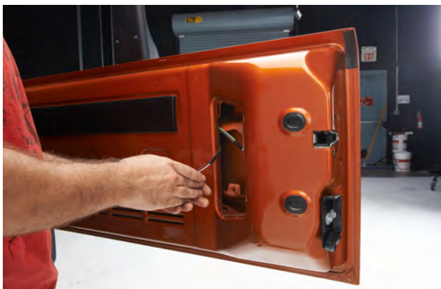
STEP 2 // Disconnect the third brake light harness, which can be accessed through the rear panel of the tailgate.