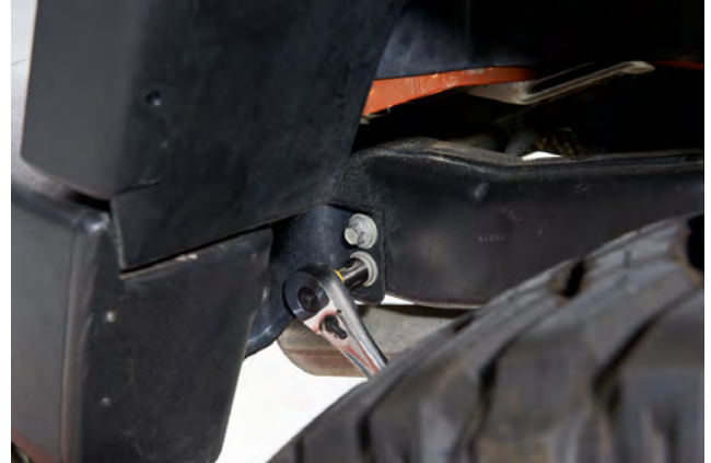
STEP 3 // Remove the (4) 15mm bolts securing the rear bumper.