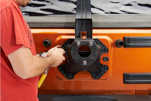
STEP 1 // Remove the rear tire and the (8) 13mm bolts holding the tire carrier to the tailgate.