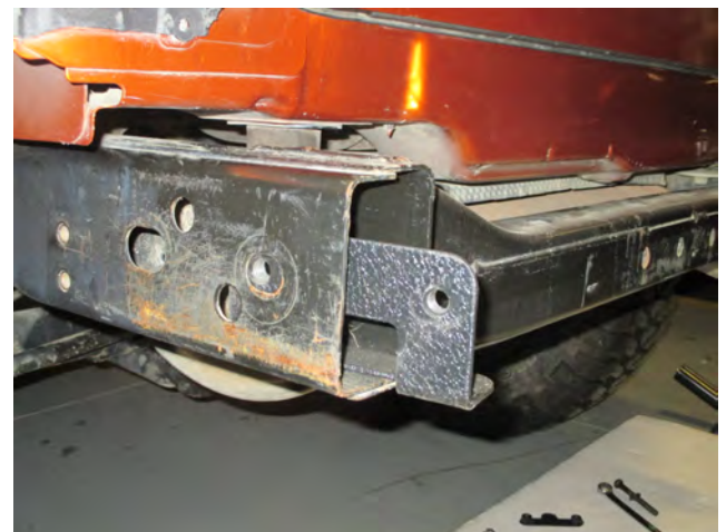
STEP 4 // Next, slide the L-shaped mounting brackets into the frame rails with the nut backing up to the predrilled hole in the frame.