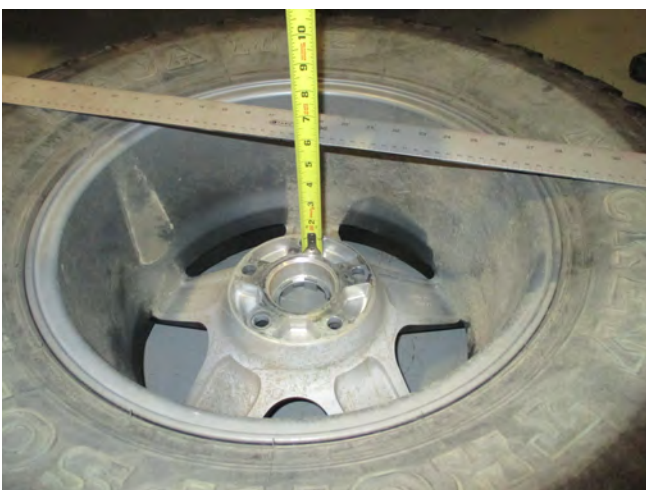
STEP 13 // Measure the backspacing of your wheel and tire by placing a straight edge across the tire. Measure from the mounting hub to the straight edge.