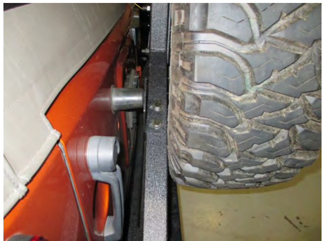
STEP 15 // Torque the spare tire lug nuts to the manufactures specified torque spec.