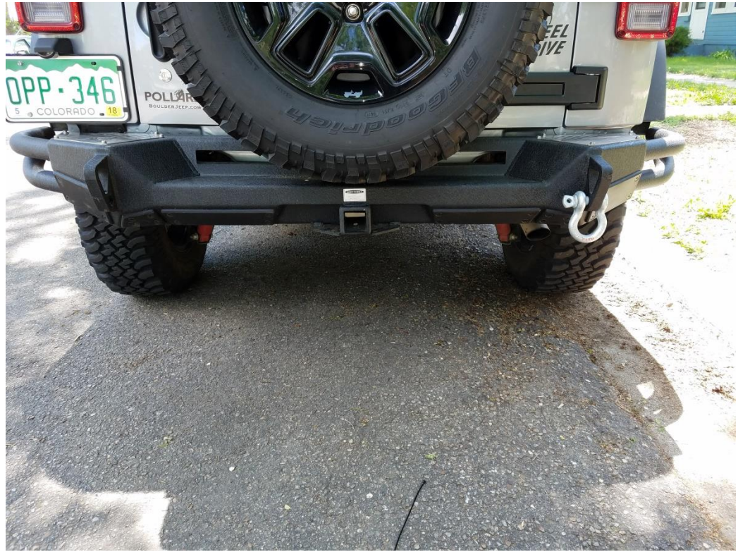
NOTE: The factory spare is pressing against the vertical part of the new bumper, with minimal pressure needed to close the tailgate. However, oversized width tires (ie greater that 255s will likely require modification to the spare mount to allow the tailgate to close properly.