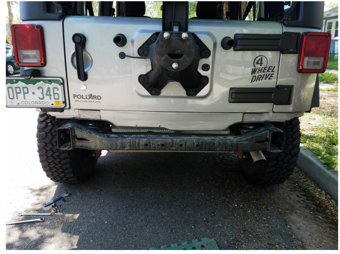
Factory Bumper, brackets and tow hook removed

2. Install reinforced box mount (aka nut plate PN 93-315BH013)inside RR frame rail