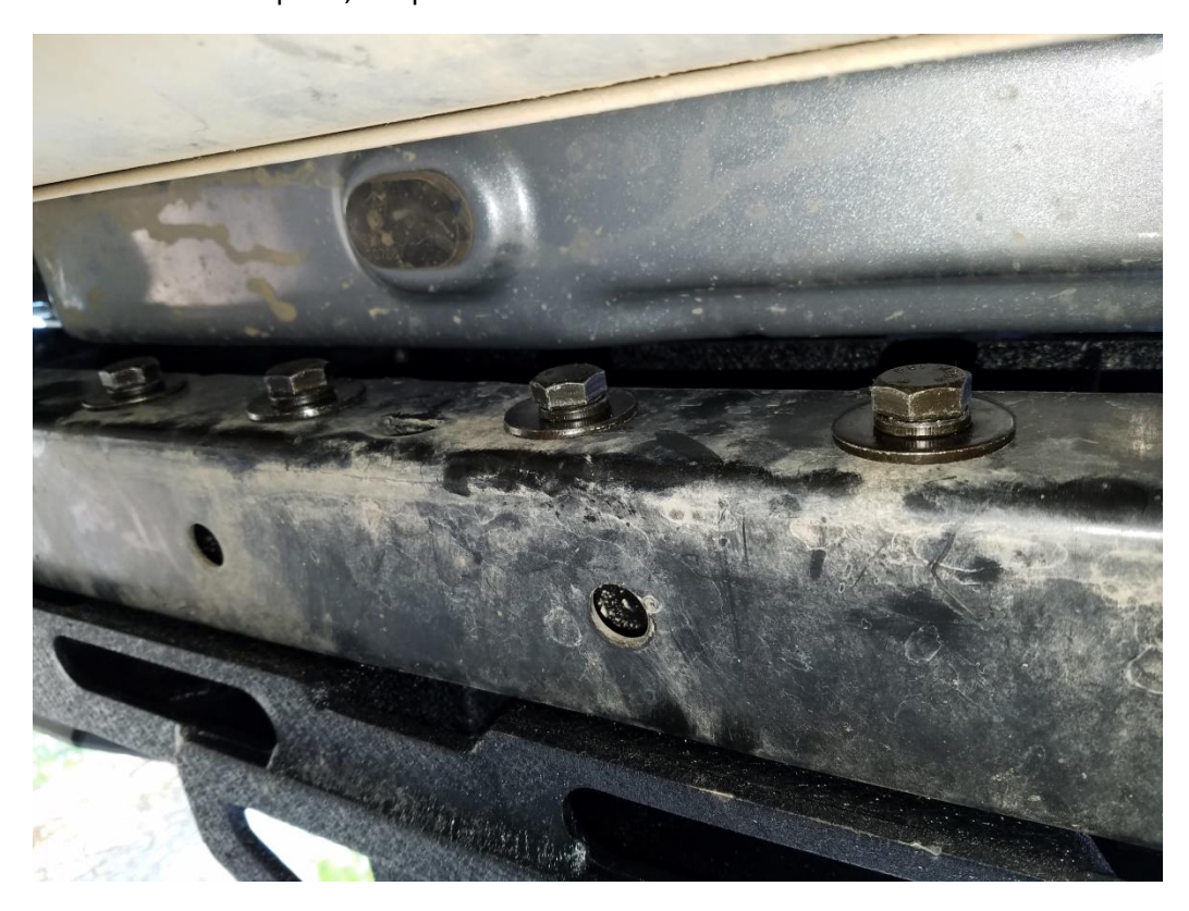
6. LR frame rail bolts in place:

5. Center bolts in place, nut plates hidden in slots: