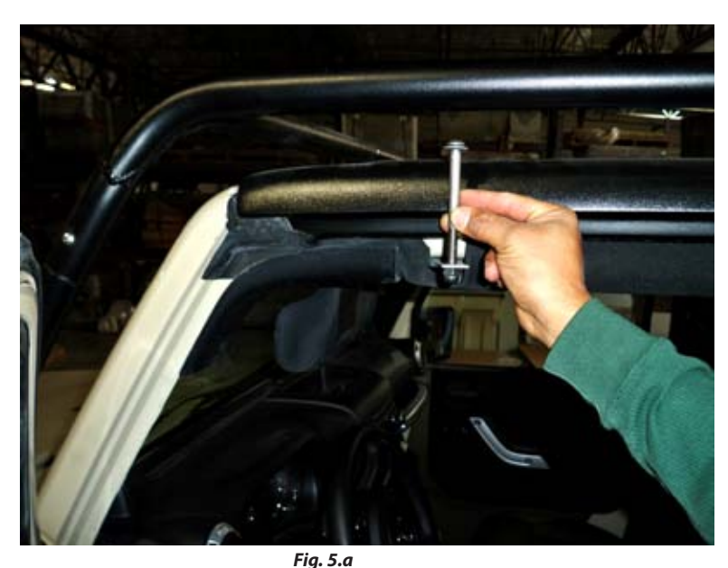
Step 5: Using the two (2) long bolts with acorn nuts and washers that were provided. Drive them in through the top front corners through the rollbar. Use these to tighten down the front corners to your Jeep. (Fig. 5.a)

Step 6: Using a 7/32" allen wrench and a 5/8" (16mm) wrench tighten down the bolt so that the top ends up even and flush with the Jeep. (Fig. 5.b)