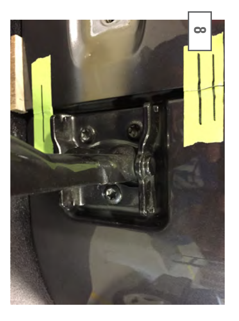
With the hinges unbolted from the tailgate, open the hinge to access the (3) T-50 Torx bit bolts.