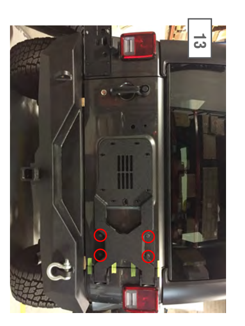
Use the factory hinge bolts to secure the tire carrier bracket to the tailgate. Ensure the reference marks made earlier still line up prior to tightening the tire carrier bracket.