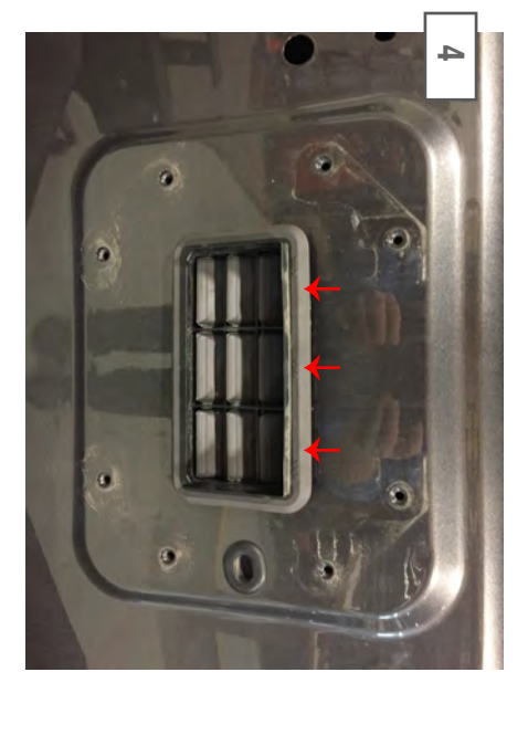
Using a panel removal tool, remove the factory air vent.