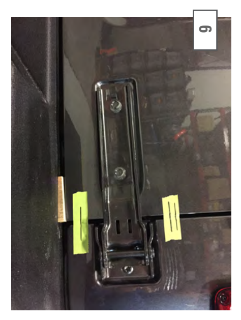
Shim the bottom of the tailgate to prevent it from sagging when the hinge bolts are removed.