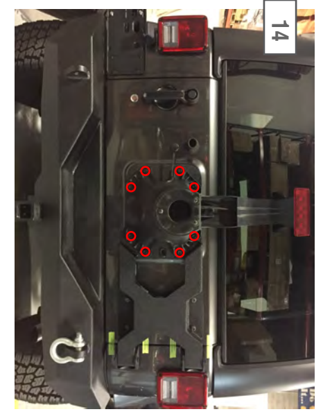
Install the factory tire carrier on top of the Barricade tire carrier bracket using the factory hardware.