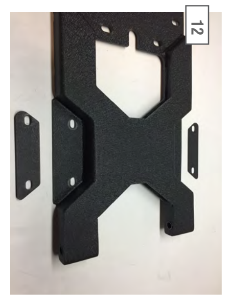
Place the thin spacer behind the upper tire carrier bracket mount, and the thick bracket behind the lower tire carrier bracket mount.