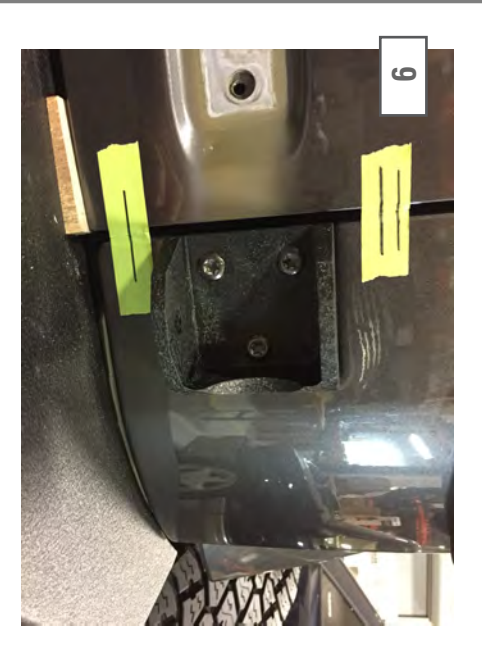
Attach the supplied hinge mounts using the factory T-50 Torx bolts. Tighten the bolts down is several passes, they will self-center.