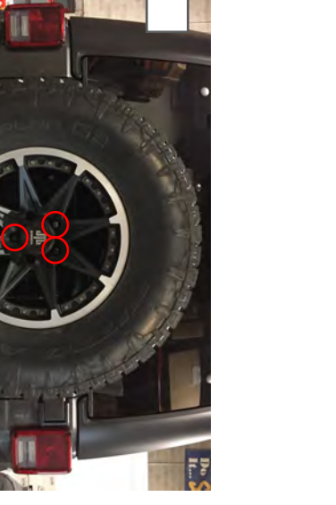
Begin by removing the spare tire.