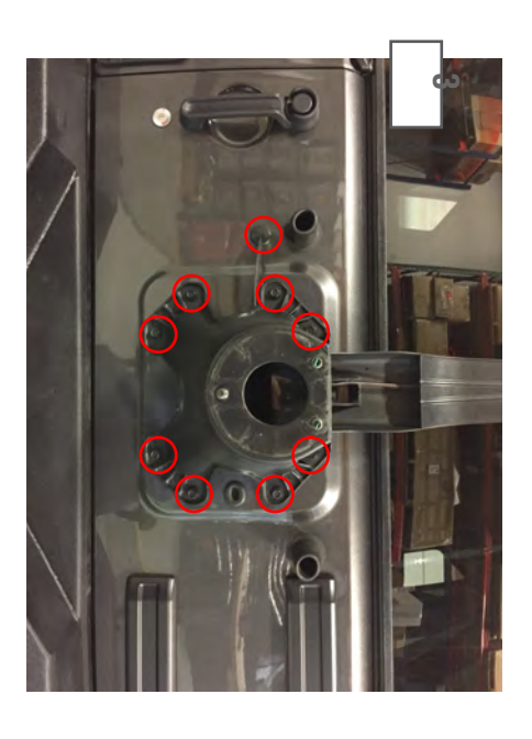
Remove the (8) 13mm bolts holding the factory tire carrier in place. Remove the 3rd brake light wiring grommet to remove the plug from the vehicle.