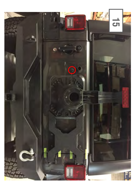
Route the brake light wiring back into the car. Plug the connection in and re-install the vent cover.