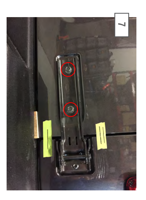
Remove the plastic hinge covers followed by (2) 13mm bolts securing the hinge each hinge to the tailgate.