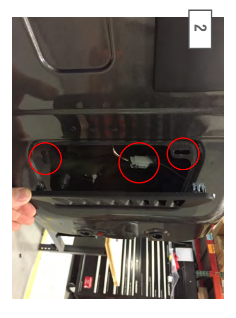
Open the tailgate to access the 3rd brake light connector. Remove the vent cover with a panel removal tool. Unclip the brake light wiring harness. Close the tailgate. Do not install the vent cover.