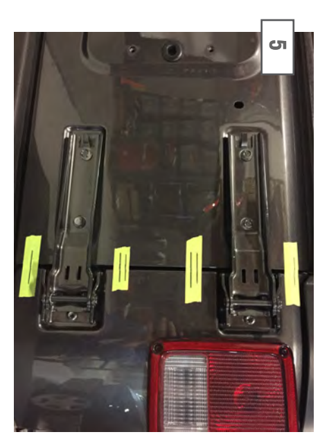
Next, apply painters tape to the vehicle so that you can line up the tailgate correctly if need. Mark the tailgate in several locations. Use a straight edge to mark the tape as a visual reference. Use a razor blade to cut the tape in half at the seam.