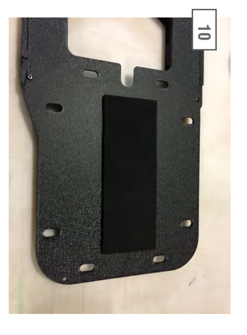
Install the foam cover for the air vent hole. Remove the double sided tape backing on all (4) corners. Install the foam to the tire carrier bracket.