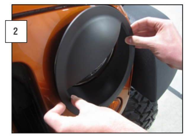
Peel the backing from the adhesive and place the bezel over the headlight opening as shown. Be sure to line up the bezel properly so it follows the contour of the grille.