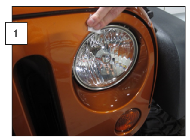
Using the supplied alcohol prep pads, thoroughly clean the area of the grille where the tape from the angry eye bezels will adhere.