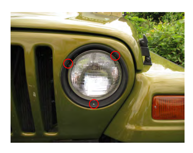
Step 2: Remove the 4 T15 Torx screws that hold the headlight bezel.

Remove the 3 T15 Torx screws that hold the head-light trim bezel.