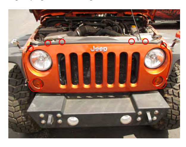
Step 2: Remove the 4 T15 Torx screws holding the headlight bezel.

Open Hood and remove the six (6) plastic clips holding the grille to the vehicle. Disconnect the turn signal plugs and remove grille from vehicle.