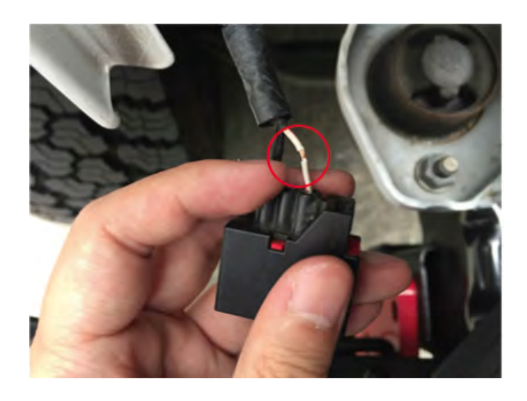
Splice the Green wire from the headlight to the factory turn signal power as seen above.