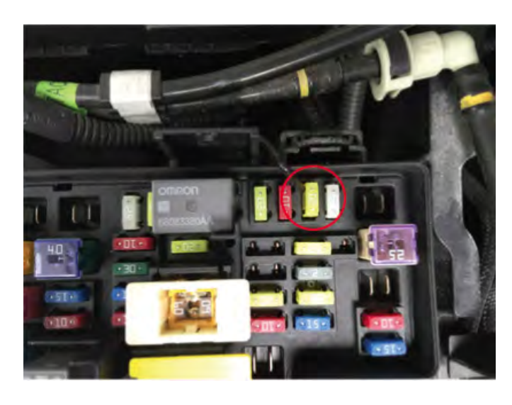
Tap the Red wire from the headlight into the 12v+ignition wire in the fuse box as seen above.