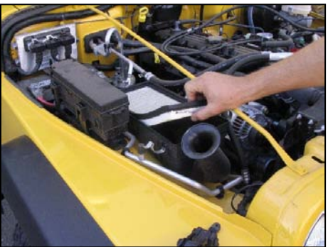
4. Remove factory air filter from airbox.