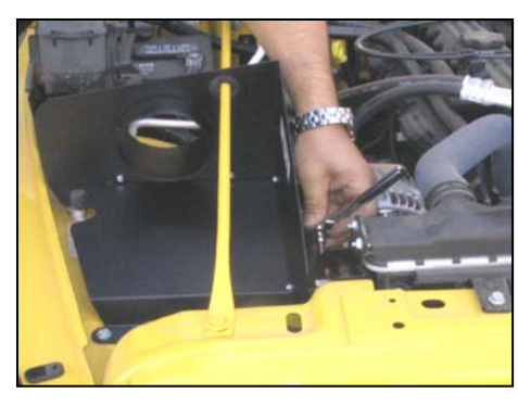
15. Using the original bolt from step 5, mount the Airaid Cool Air Dam to the passenger side radiator mount.