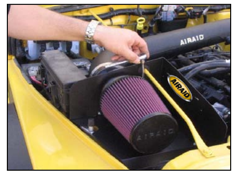
27. Install the Airaid Premium Filter on the Cool Air Dam assembly. Secure the filter using the supplied hose clamp.