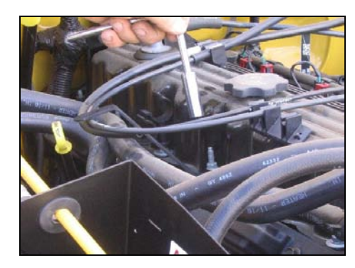
16. Remove one valve cover bolt on the passenger side nearest to the oil fill cap. Use this bolt to mount the supplied mounting bracket to the engine as shown above. Leave bolt loose until final assembly