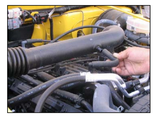
1. Disconnect negative battery cable. Remove factory valve cover breather hose from intake tube and discard. Retain plastic valve cover fitting for later use.