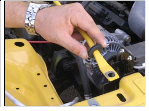
11. Using the supplied thin grommet, position it over the passenger side radiator support rod as shown above.