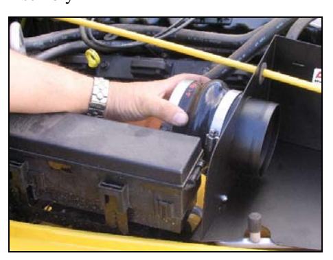
20. Install the urethane hump hose and two #72 hose clamps on end of the Airaid Cool Air Dam. Leave hose clamps loose until final assembly.