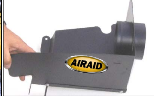
10. Using the supplied hardware, assemble the Airaid Cool Air Dam assembly as shown above. Apply the Airaid Decal as shown, on