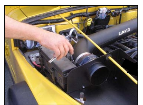
24. Make final adjustments to the intake tube for correct position. Tighten all four hose clamps and bracket bolt.