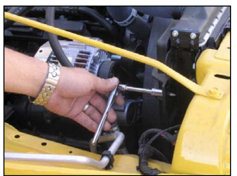
6. Using a 7/16" socket, remove the factory radiator mount bolt. Retain bolt for later use.