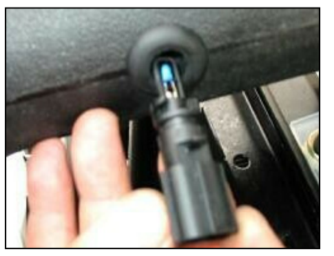
18. For 2005-06 Vehicles: Install the supplied rubber grommet with the hole. Next, install the factory air temp sensor retained from step 3 into the grommet.