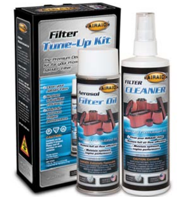
P/N 790-551 Aerosol Spray