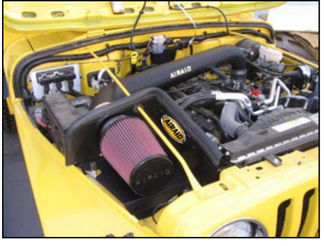
28. Install the weather strip on the edge of the Cool Air Dam assembly as shown above. Reconnect negative battery cable. Double-check your work to be certain that all nuts, bolts, and clamps are securely fastened.

Thank you for purchasing the Airaid Intake System. Contact Airaid @ (800) 498-6951 8:00 AM - 5:00 PM MST weekdays for questions regarding fit or instructions that are not clear to you. Your Airaid Intake System was carefully inspected and packaged. Check that no parts are missing, or were damaged during shipping. If any parts are missing, contact Airaid. The air filter element is protected from direct exposure to water and debris; care should be taken not to drive through deep water. WATER INGESTION IS THE DRIVERS RESPONSIBILITY! The air filter is reusable and should be cleaned periodically.