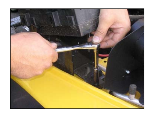
13. Align the mounting holes in the Airaid Cool Air Dam with the factory holes in the inner fender. Using the original bolts from step 7, mount the Airaid Cool Air Dam to the inner fender.