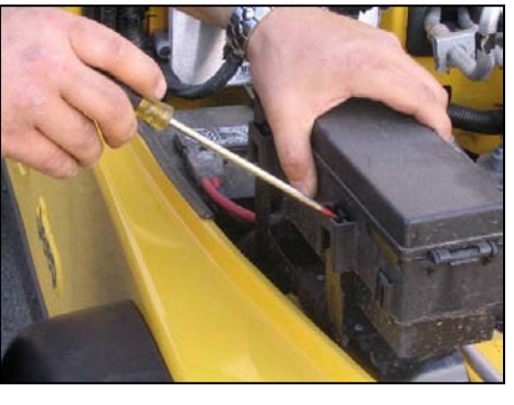
7. Using a flat blade screwdriver, push locking tabs inward to remove the fuse panel from the mounting bracket. Position panel out of the way to access the bolt underneath.