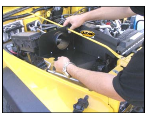
12. Carefully slide the Airaid Cool Air Dam assembly over the passenger side radiator support rod. Be careful not to scratch the paint. Insert the rubber grommet into the panel for final positioning of the assembly.