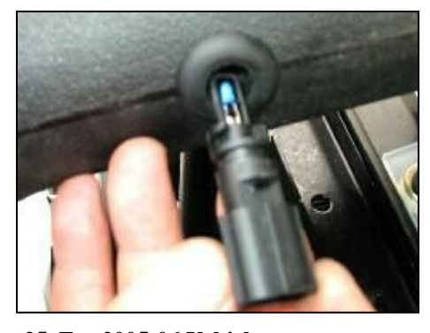
25. <u>For 2005-06 Vehicles:</u> Re-connect the air temp sensor on the backside of intake tube.