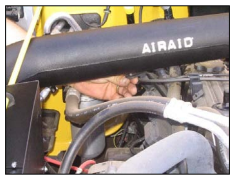
23. Mount the Airaid intake tube to the valve cover bracket using the supplied 1/4" bolt and washer as shown above.