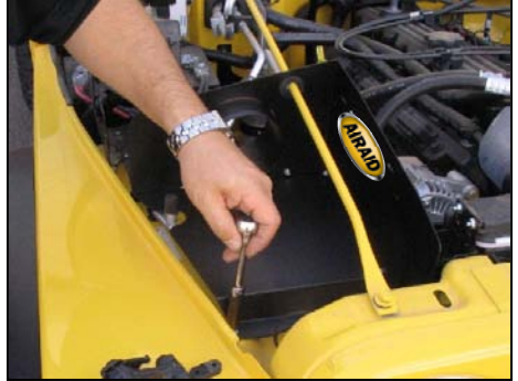
14. Using the supplied \frac{1}{4} x 20 nut, bolt and washers, mount the front of the Airaid Cool Air Dam to the inner fender.