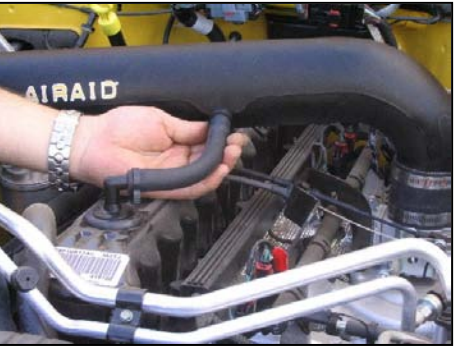
26. Connect the other end of the valve cover hose to the intake tube. Secure both ends of the hose using the supplied black speed clamps.