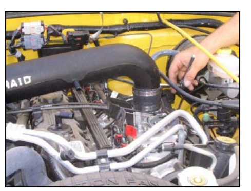
22. Install Airaid intake tube by connecting both ends into the urethane hump hose and reducer.