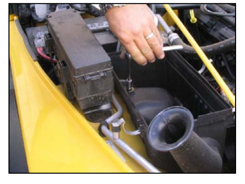
5. Using a 5/16" socket, remove the three nuts and bolts mounting the factory air filter housing to inner fender. Remove air filter housing.