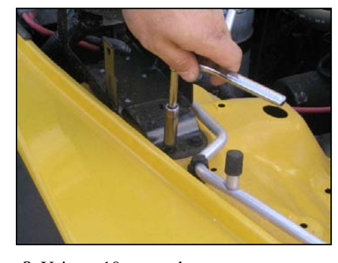
8. Using a 10mm socket, remove one bolt from the inner fender as shown above. Retain bolt for later use.