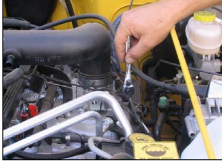
2. Loosen hose clamps on both ends of factory intake tube. Remove intake tube from engine.