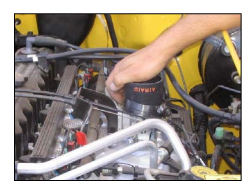
21. Install reducer coupler on throttle body with two #44 hose clamps. Leave hose clamps loose until final assembly.