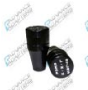
P/N 303150AA $42.95 each