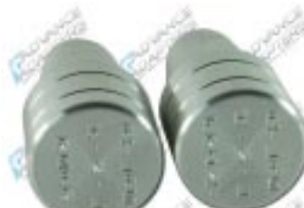
P/N 303152 $42.95 set