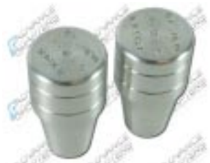
P/N 303150 $42.95 each

This shifter will not fit the Allison transmission due to cable interference with the stock adapter housing.