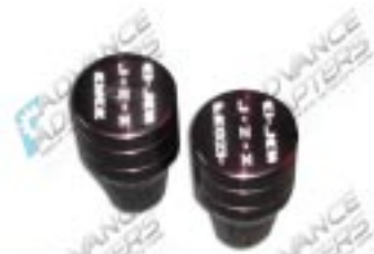
P/N 303152AA $42.95 set

Depending on the orientation of the shifter housing in the vehicle, the black shift knobs may be labeled backwards. Unfortunately, we are unable to get a small quantity of the black knobs with a shift pattern labeled opposite compared to the knobs included in this kit. We can offer a set of aluminum knobs which are labeled either way.