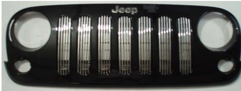
Figure 2 – Front View of positioning lower Billet Grille