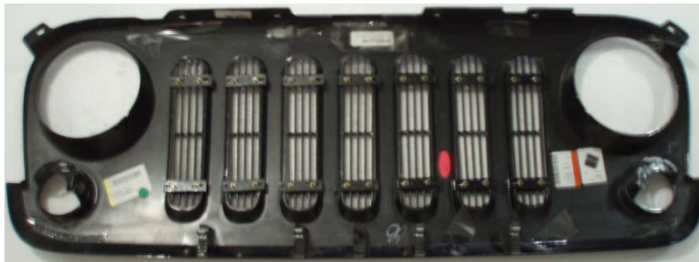
Figure 3 – Rear view of vehicle's shell; Billet Grilles attached with Metal Brackets and Flange Nuts