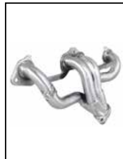
Twisted Steel Header