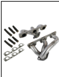
Twisted Steel Header