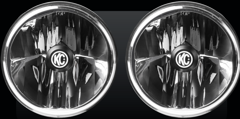
Gravity LED Headlights Pair Pack System #42351