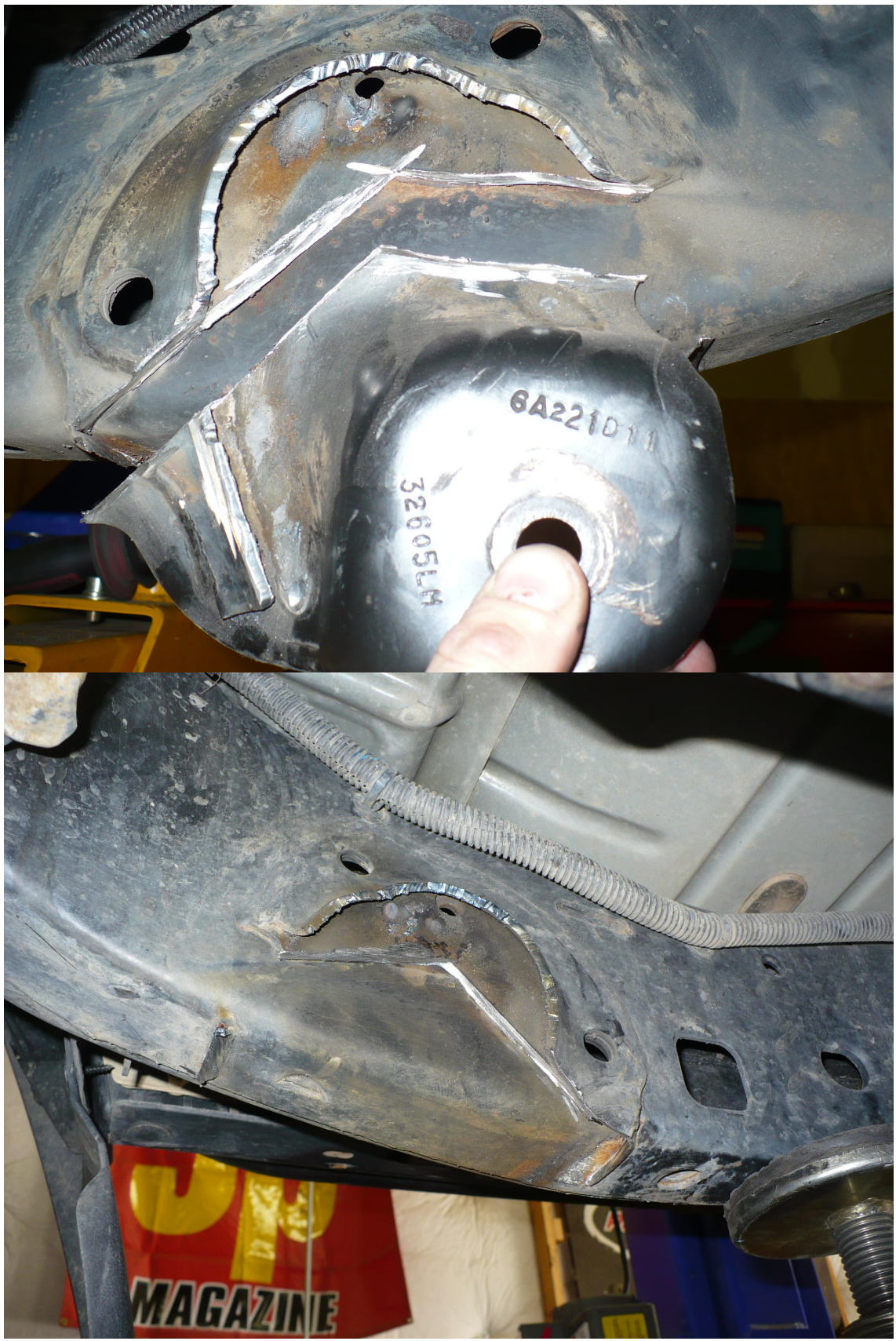
8) Use a 4-1/2" angle grinder with cut off wheel or similar cutting tool. Cut at the top of the weld as shown below. Cut through both layers of bracket, but be careful not to cut through the frame. You should end up with a deep scribe rather than a full on cut.