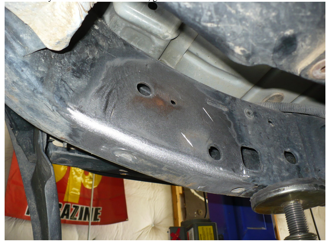
11) Test fit the bracket. The bracket should position in the same relative position as stock.

10) With bracket fully removed as shown above, grind smooth the frame.